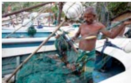
A Sri Lankan fisher with nets provided by FAO. Top: A boat-engine repair shop in Sri Lanka.

"After the tsunami we had an emergency situation. International donations were available. There was sudden pressure on the