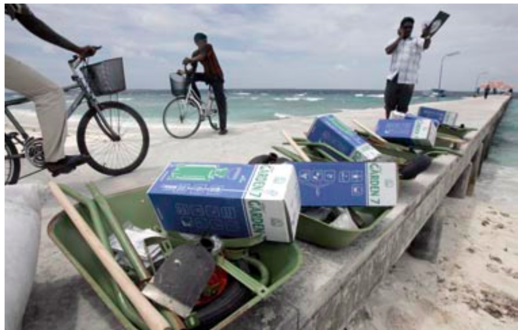
Right: Farming kits for tsunami-hit farmers being delivered to Landhoo Island, the Maldives.