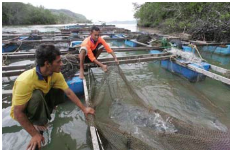
Left: A fish farm in Phuket, Thailand rebuilt with FAO help.