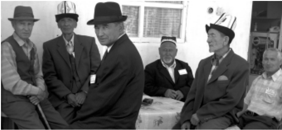
Groups of older people in Kyrgyzstan are volunteering as mediators.