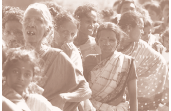
Older people should be included at all stages in the response

It can be used to raise awareness among relief agencies of older people's needs, and to help ensure that vulnerable older people receive adequate assistance.