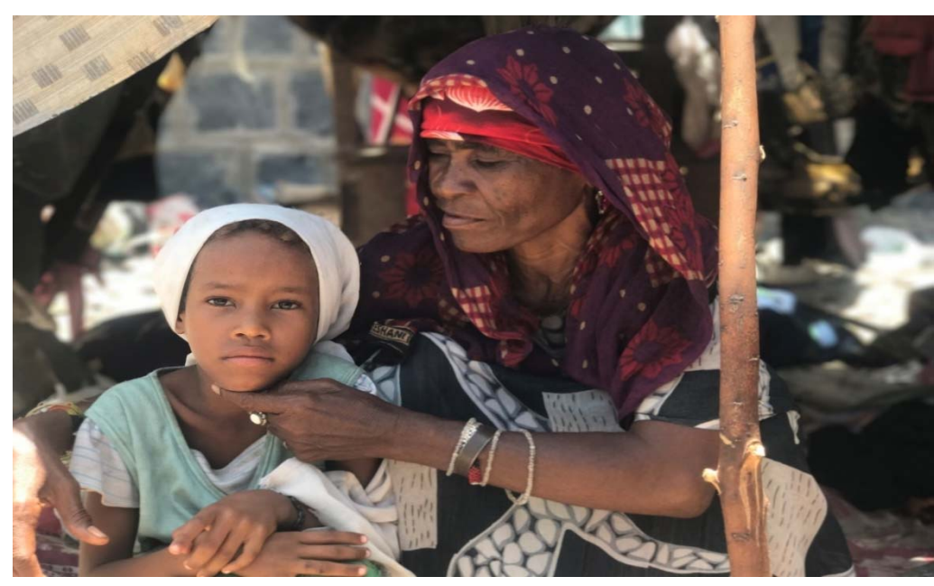
Displaced mother and daughter on the streets of al-Hudaydah city.

Fighting in Yemen escalated dramatically in late-May, when the frontlines in al-Hudaydah began to make rapid advances to the edge of al-Hudaydah City. As documented by OHCHR, the governorates most affected by casualties in the first five months of 2018 were Sa'ada (19%), al-Hudaydah (16%), Taizz (15%) and Sana'a and Amanat al-Asimah (14%). According to the Protection Cluster's Civilian Impact Monitoring Project, a total of 844 incidents of armed violence with civilian impact were recorded in the last six months in monitored governorates, resulting in 1,828