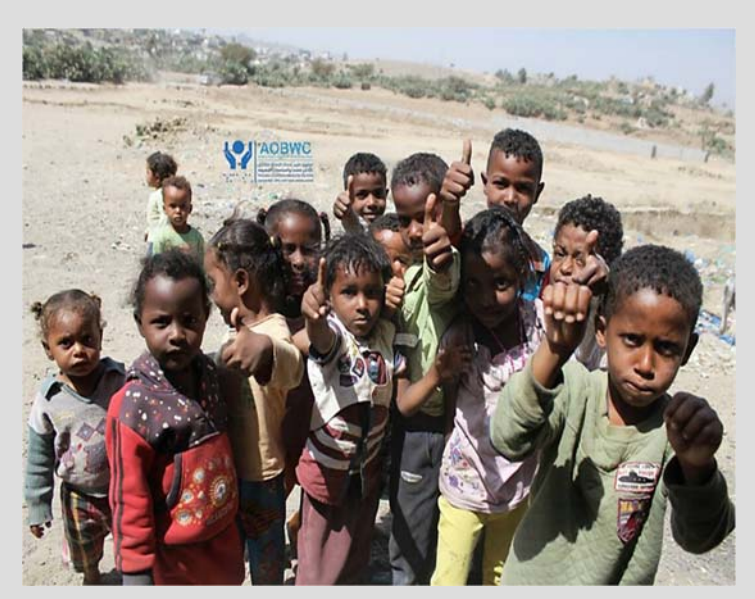
Displaced children playing at hosting site.

Psychosocial support is a strategic activity of the Protection Cluster intended to address the severe, adverse effects on the physical, social, emotional and spiritual well-being of persons due to exposure to conflict, violence, family separation, lack of access to services, and other reasons.