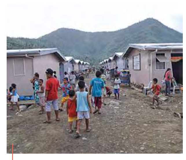
Life inside the International Pharmaceuticals Inc. bunkhouse community in Tacloban, one of the biggest cities affected by Haiyan.

The government initially recommended the establishment of a blanket no-build zone stretching 40 metres