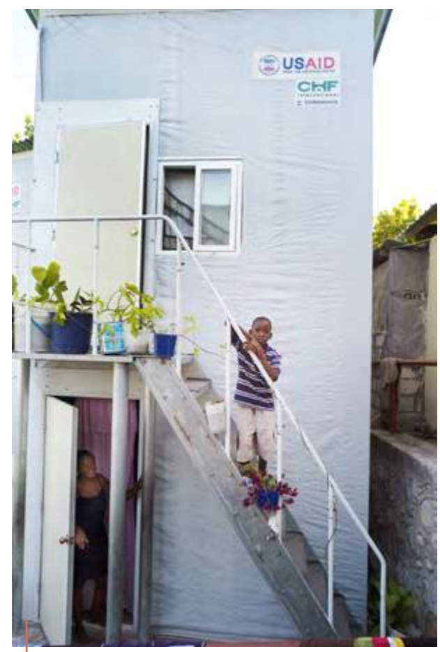
Residents in new housing in Ravine Pintade, a hilly area in the center of Port-au-Prince which was previously damaged by the earthquake. An extra floor was added to address the small size of the plots. Photo: CHF/Maggie Steber, May 2012

The Nansen principles build on the Human Rights Council 2009 report, which explores the link between disasters and human rights. As mentioned above, the report examines the impact of climate change and disaster-induced displacement on the enjoyment of specific rights and on vulnerable groups, and ways in which it contributes to forced displacement and conflict.<sup>61</sup>