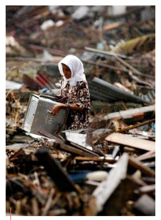
An Indonesian woman searches through debris in the rain, where her house once stood, in the city of Banda Aceh on the island of Sumatra, Indonesia.

The case study illustrates the need to facilitate durable solutions for displaced informal settlers that take social cohesion and access to livelihoods into account. It shows that cash grants are in this case used as a short time