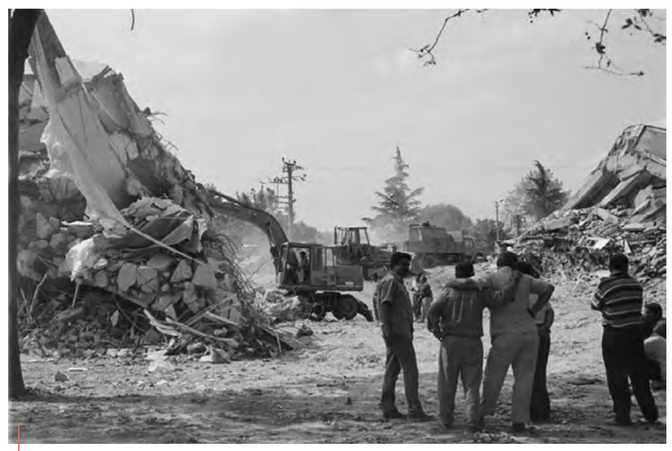
The devastation of the 1999 Turkey earthquake.

fected by the earthquakes, initially focused on ensuring that property owners would benefit from the government's programme, and later supported the tenants and urban informal settlers sidelined by it. Two years after the earthquakes, when the municipality began demolishing tenants' and informal settlers' prefabricated houses and tents without offering them alternative housing, the association questioned government policies that only considered the owners of damaged and destroyed property as "victims".