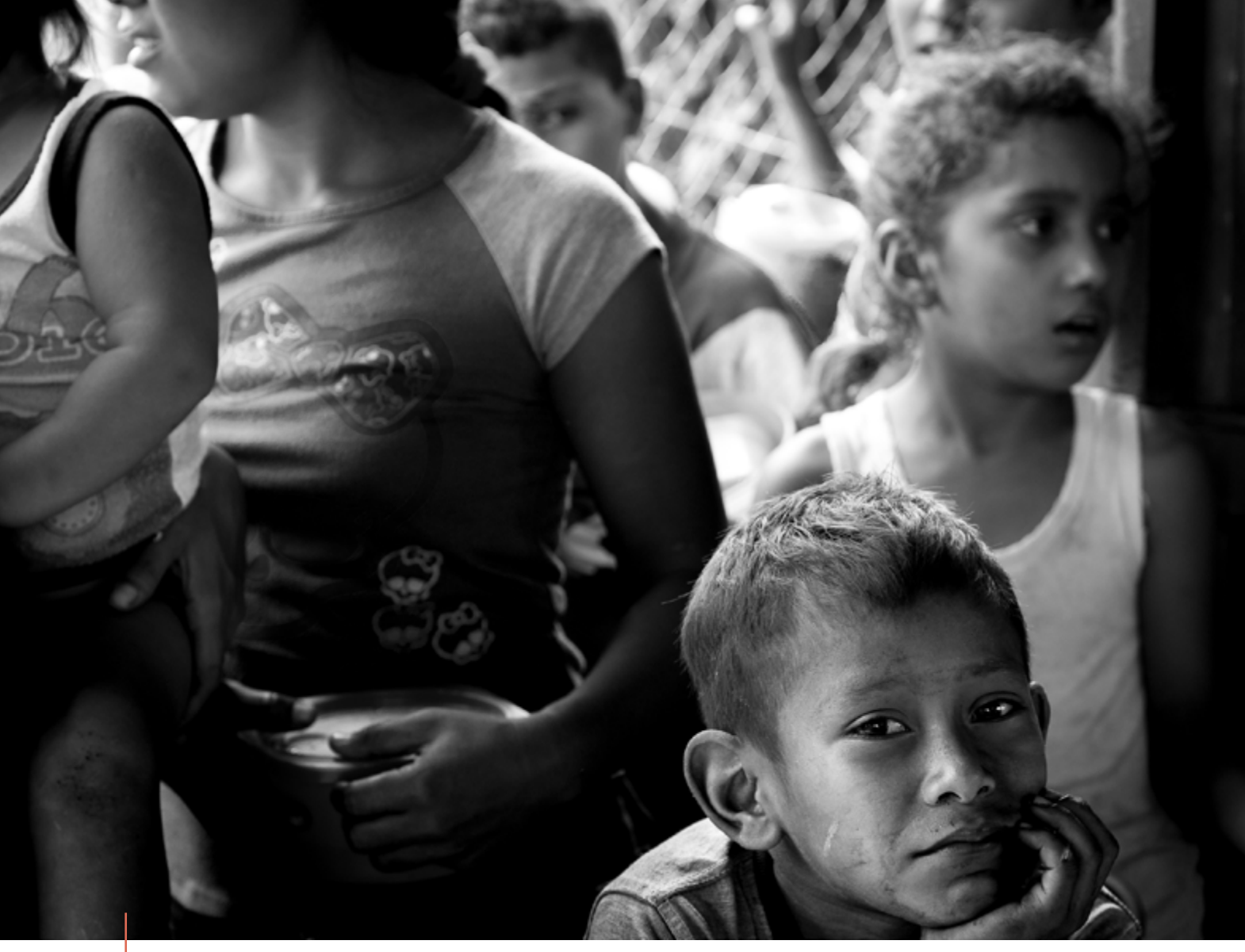
Displaced villagers from Hurricane Mitch now living in the Chinnidaga Dump. Photo credit: Jana Allingham, November 2014. https://flic.kr/p/pUe5Sa

ment partners, international organisations showed little interest in the barrio project and preferred to develop their own programmes.