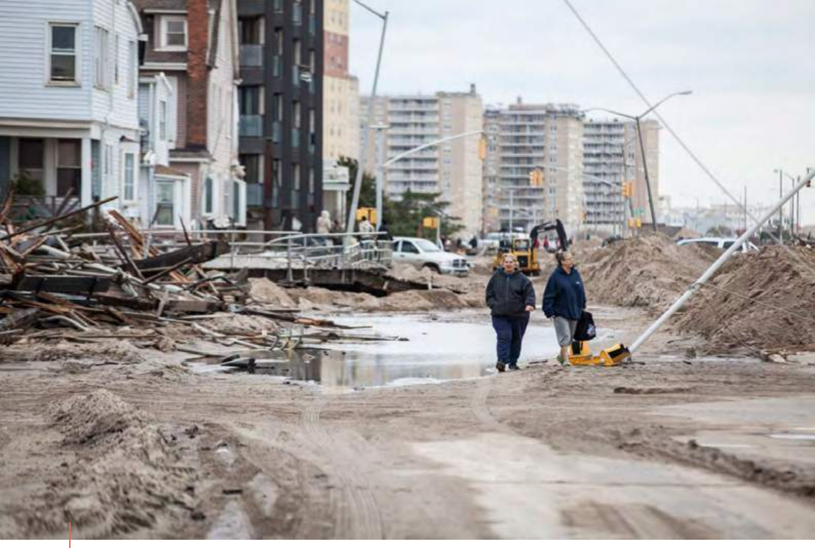
Residents survey the scene on Long Island, New York following Hurricane Sandy. Photo credit: The Legacy Center, November 2012

The displacement disasters cause increases their vulnerability to human rights violations still further. They may face discrimination on the basis of their tenure status, in that they may be ineligible for reconstruction assistance if they do not own their land or home, and they may be exposed to forced eviction and unjustified or inadequate relocation if their settlement is declared unsuitable for reconstruction. Urban IDPs forced to flee again by a disaster face similar challenges, often made worse by their illegal presence in a settlement and their lack of documents proving residence.