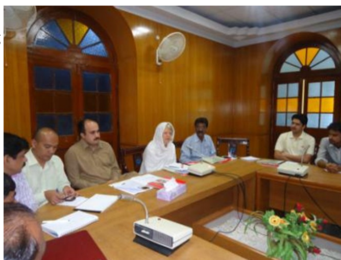
District level coordination meeting at Mirpurkhas being attended Global Education cluster Coordinators

As shown in the graph below some 4,382 floods vul-