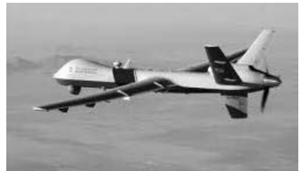
Extra Judicial Killings by Drone attacks

The United States government, led by the Central Intelligence Agency's Special Activities Division, has made a series of attacks on targets in Khyber Pakhtoon Kah (KPP), the former North West Frontier Province (NWFP), since 2004 using drones (unmanned aerial vehicles). Most of these attacks are on targets in the Federally Administered Tribal Areas along the Afghan border in Northwest Pakistan. These strikes are mostly carried out by unmanned aerial vehicles (UAVs).