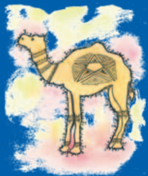
Economic recovery and environmental protection