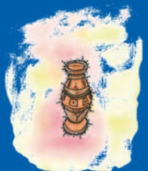
Protecting and empowering women