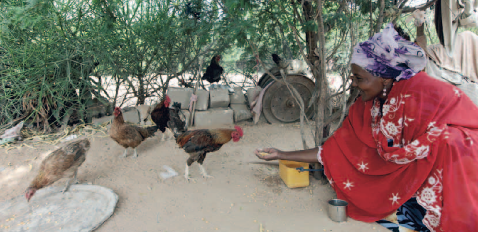
UNDP's economic recovery efforts provide equal opportunities for women, including access to assets, such as land and credit. Here in the Mohamed Moge camp in Hargesia, women are benefiting from UNDP support to raise chickens and thereby to improve their income opportunities.