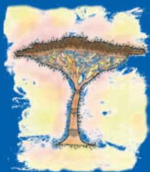
Peace building and conflict management