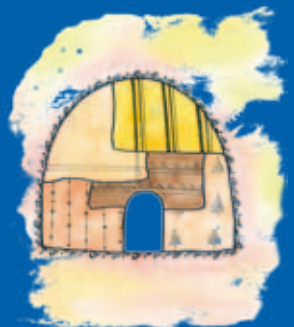
People-centered governance and law